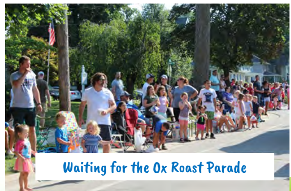
Waiting for the Ox Roast Parade