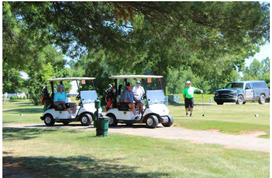
Annual Charity Golf Outing raises funds for the Foundation's Scholarship Programs

The Foundation has awarded nearly 50 scholarships to graduating seniors in Clinton County. While the Foundation will continue to fund scholarships; it will also expand its role in the community by partnering with Chamber and the DeWitt Memorial Association to create a series of community activities and events to support our goals of creating a true Sense of Place and enhancing the quality of life for the residents and businesses throughout the DeWitt Community.