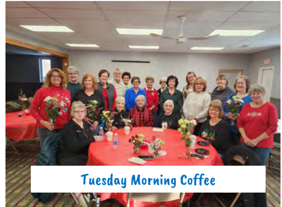
Tuesday Morning Coffee

02: Christmas Market, Christmas Light Parade, Festival of Trees & Charity Auction. Details at dewittareacc.org