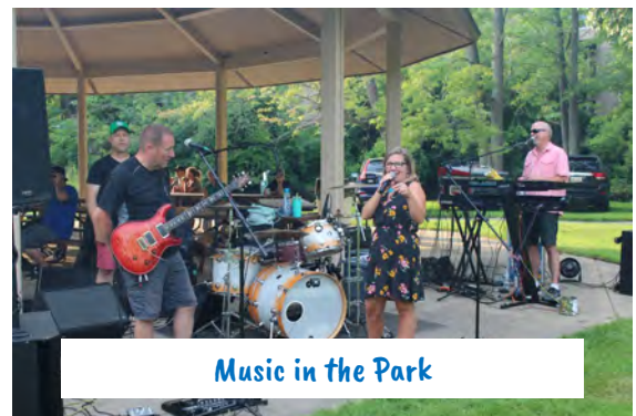
Music in the Park