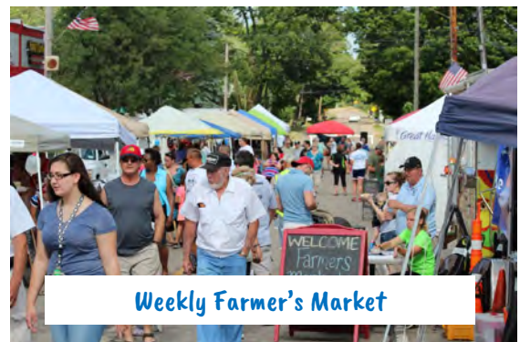
Weekly Farmer's Market